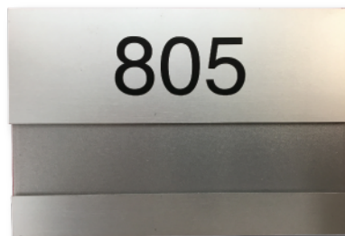
Decorative metal with non-glare window for acetate name insert, cut vinyl copy