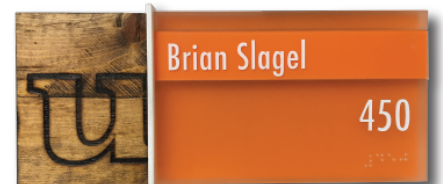
Fire-branded wood logo, 1/2" non-glare acrylic, removable magnetic name insert, raised copy & braille