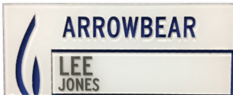
Laser-cut acrylic face, custom painted backer & removable magnetic name insert

Custom Office Signs w/ accent features (ie accent bars, screen-printed graphics, wood, aluminum, custom laser cut features or dropouts) - $100/ea and up