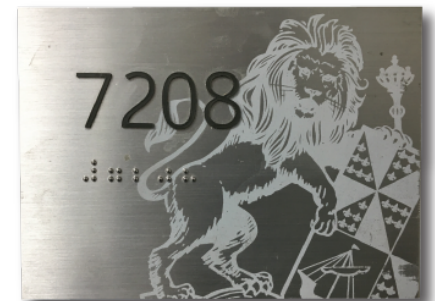
Sand-blasted, brushed aluminum, raised copy & braille