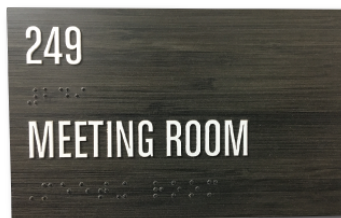
Wood veneer with raised copy & braille