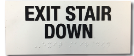
White non-glare acrylic with raised copy and braille

Custom Office and/or ADA Signs w/interchangeable name slots - $75-100/ea