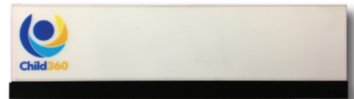
Digital print, non-glare acrylic to accept acetate name insert, painted metal accent strip

Custom Office Signs w/ accent features (ie accent bars, screen-printed graphics, wood, aluminum, custom laser cut features or dropouts) - $100/ea and up