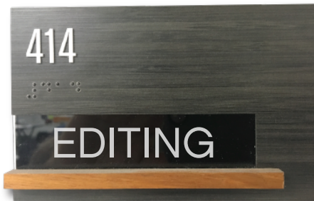
Wood veneer with laser-cut window to accept printed insert