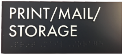
Back-painted acrylic with raised copy & braille

Basic ADA signs (no special customization) - $45-75/ea